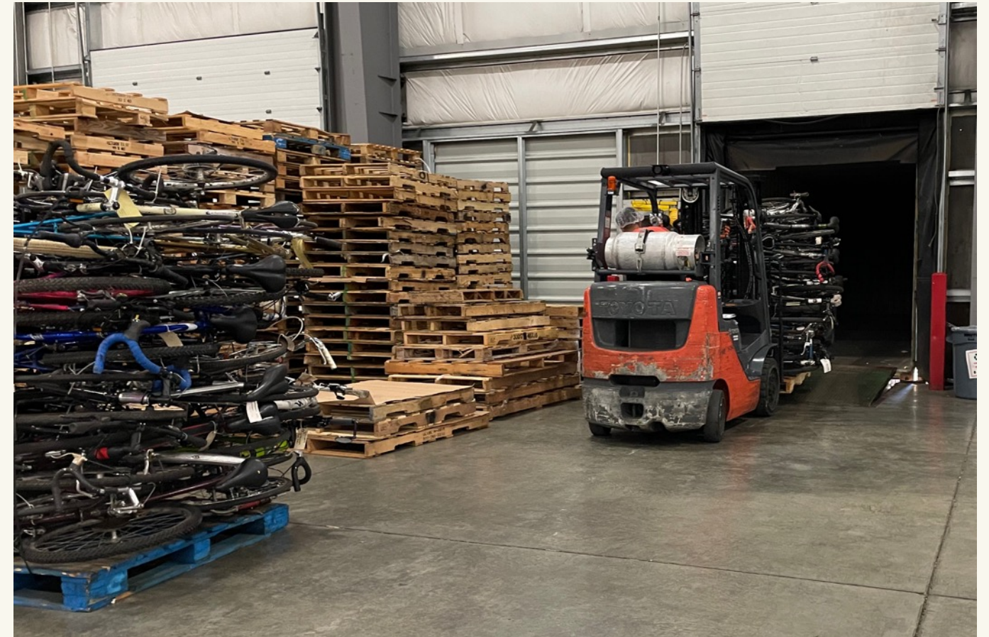
Donated Bicycles loaded into shipping container in Olympia, WA October 2022.

In October, we shipped 314 bicycles via ocean freight to be inspected, tuned, and distributed to students in 2023.