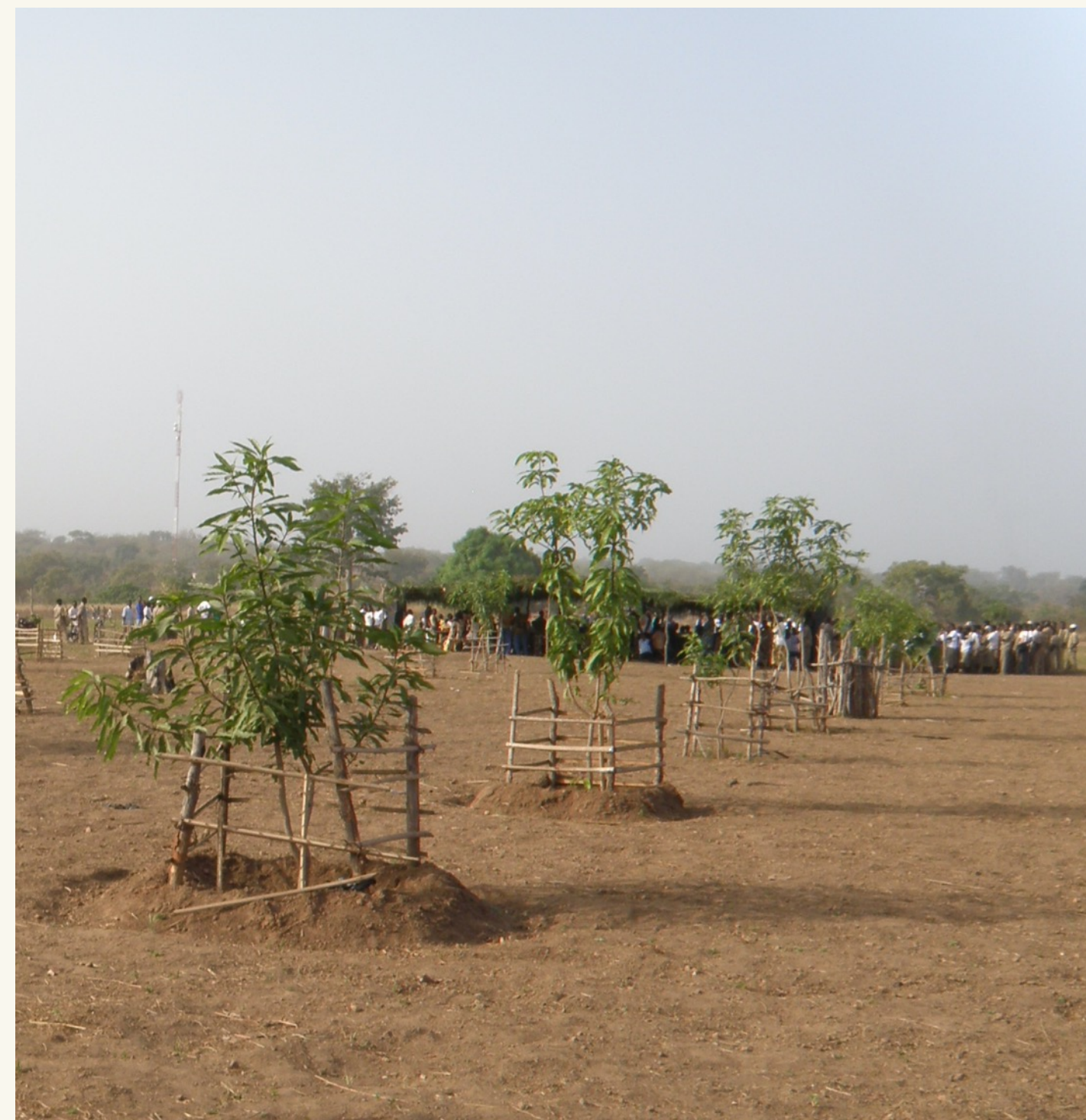
Mango trees planted by GACE and Kouloumi Secondary School, four years after planting.

Groups are more likely to provide irrigation needed to get seedlings through the first dry season and protect the young trees from grazing livestock and wildfires. This year, survival rates of saplings was low, less than 60%, due to late and unpredictable rainfall in the savanna region.