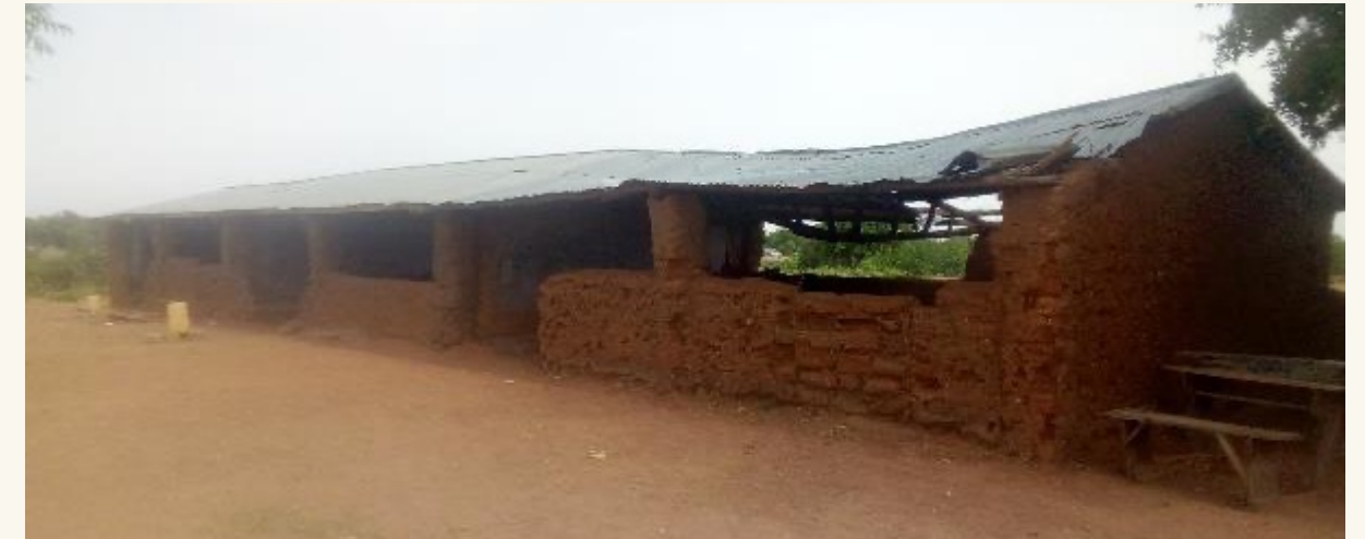
Tambonga Secondary School before GACE program, 2019

The existing structure of the Tambonga Secondary School was a semi-enclosed earthen shed built by the community in 2008. Because of the lack of space, students were being transferred to an Islamic school over 2 kilometers away. In 2020, after appeals from the community, teachers, and local authorities, GACE decided to construct a new school building for Tambonga.