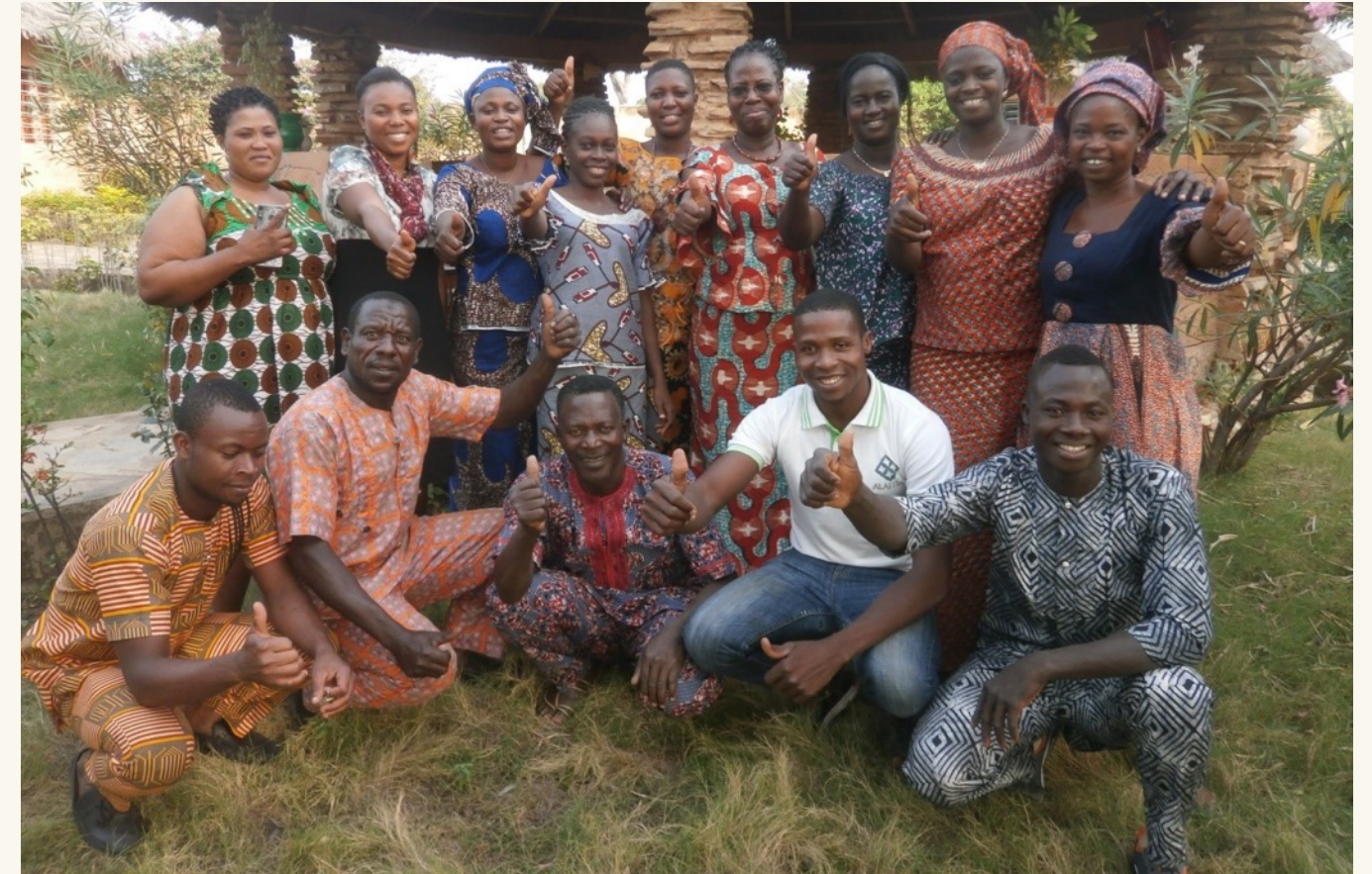
Togo Team (left to right)