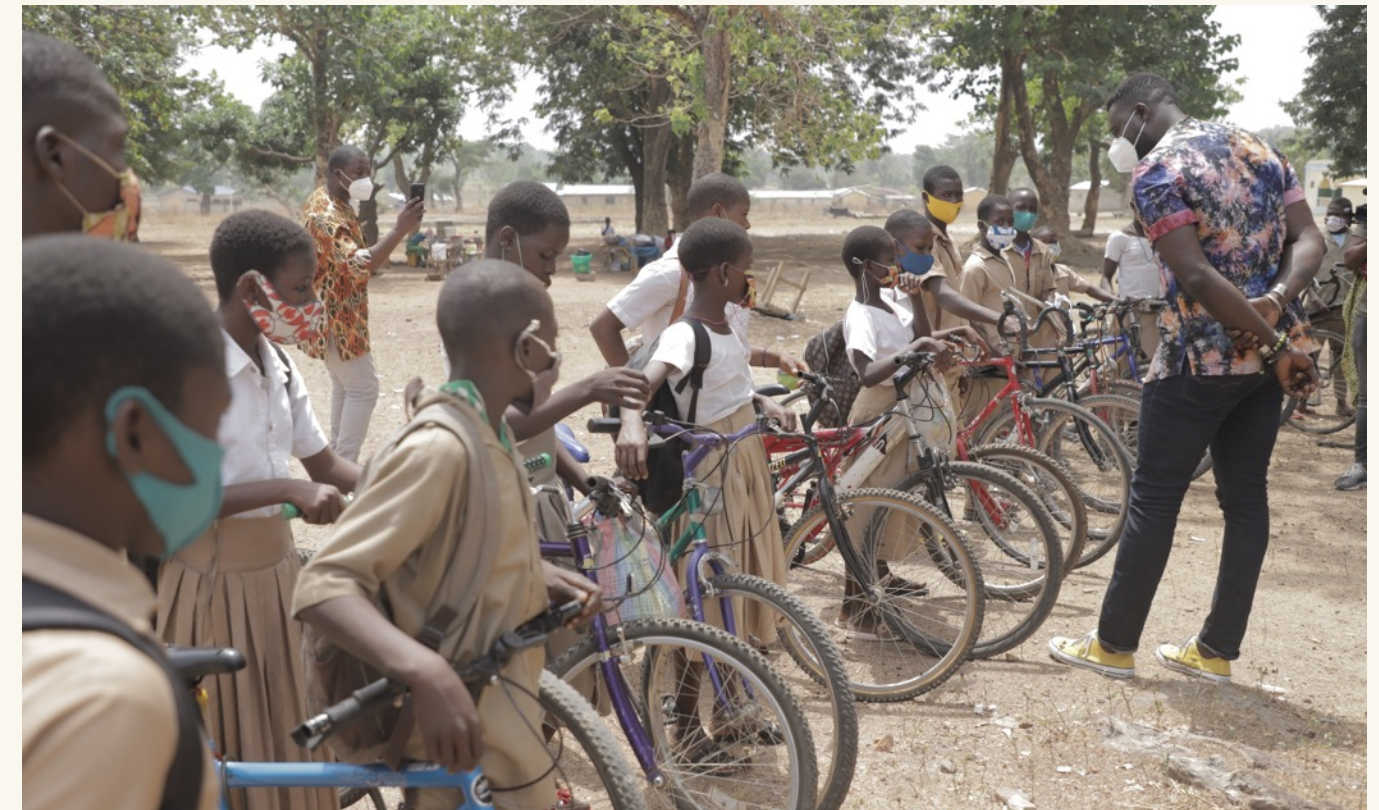
Middle school student beneficiaries of 2020 Armande, Tchamba prefecture, Togo.

Although COVID-19 delayed bicycle distributions, we were able to meet our goal of 800 bikes to students by the fall.