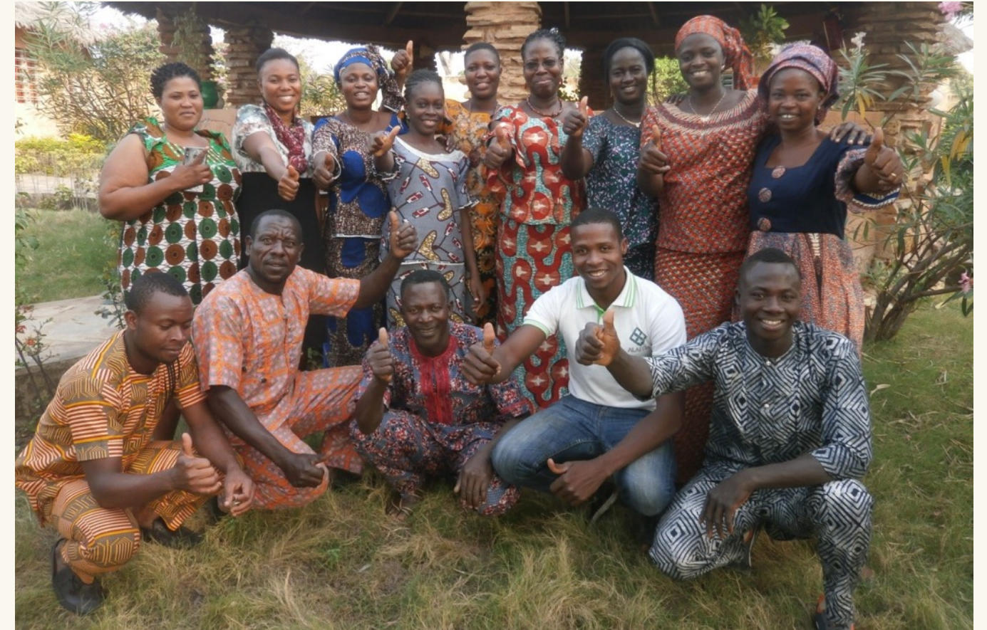
Togo Team (left to right)