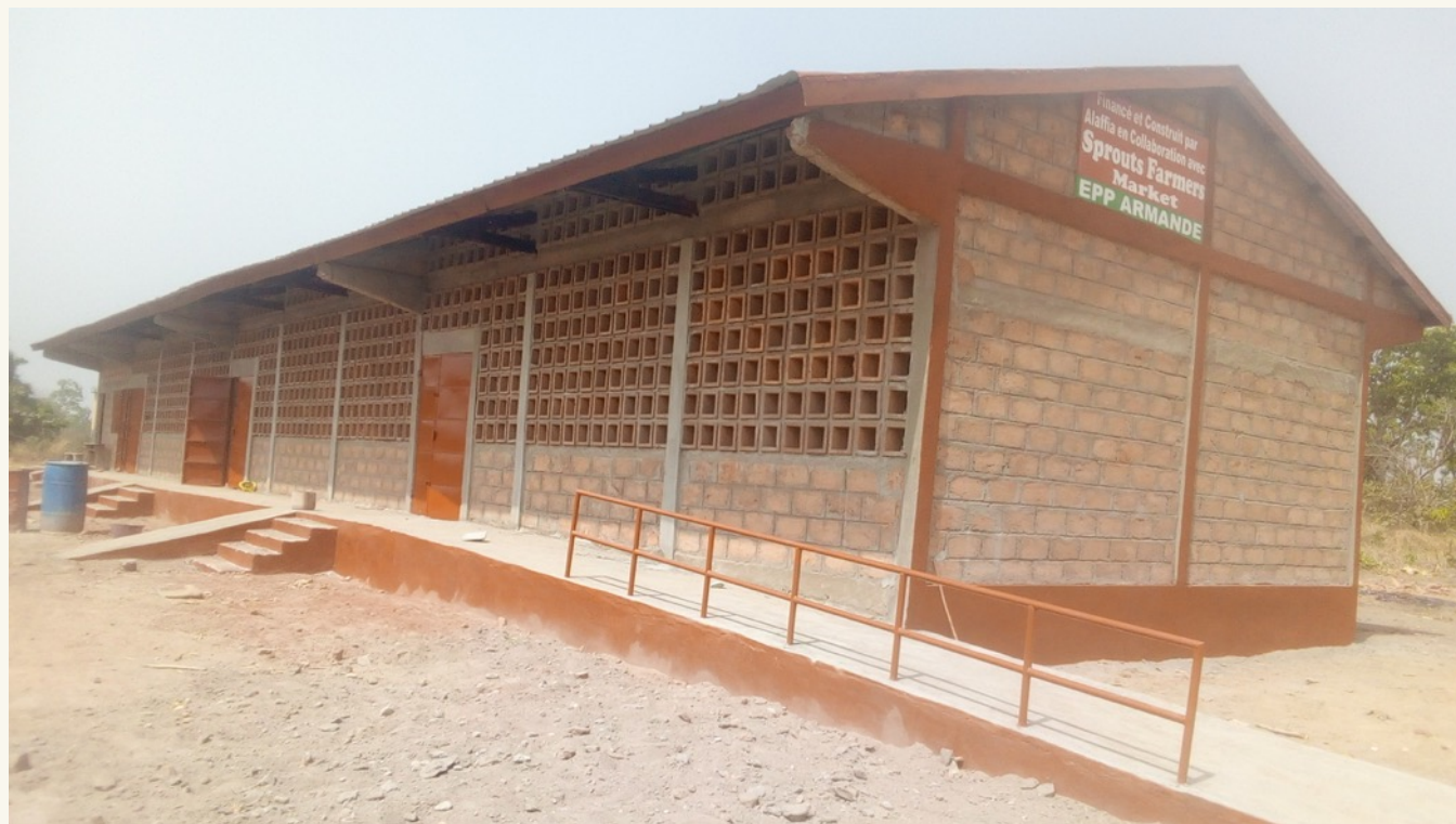
EPP ARMANDE, Primary School in Kaboli, Togo

The Armande primary school was partially funded by Sprouts Farmers Market through an Alaffia sales promotion in 2019. This promotion and donations from Sprout's employees contributed over $25,000 towards the school building costs.