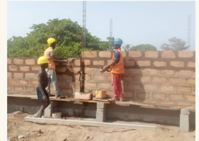
EPP Armande in July 2020 before construction, and new walls going up in October 2020.

The community erected a temporary structure for their children in 2012 which was recognized as a public school by the Togolese government in 2015. 104 children were enrolled at the Armande primary school last year, 56 girls and 48 boys.