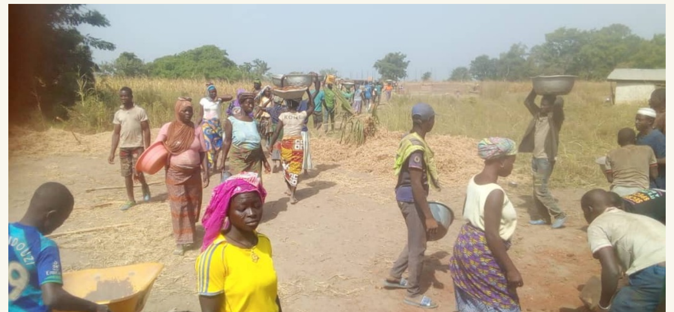
Community members help with school construction, bringing sand and water from nearby river.

The new building is made of durable and naturally-cooling laterite concrete bricks. It contains two classrooms and an office.